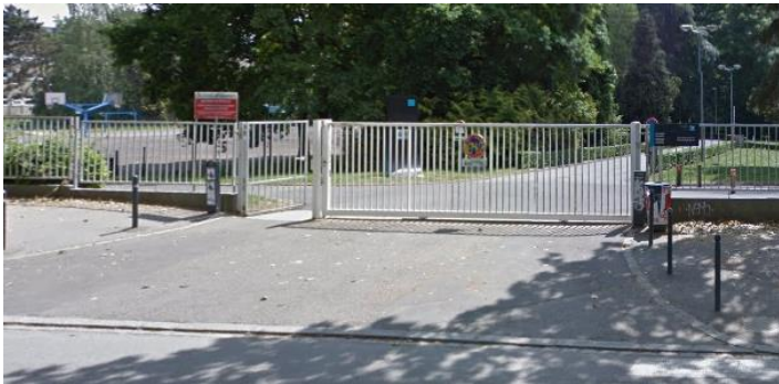
Lyce Bréquigny's Entrance

You are very close whatever your option; 1 minute to walk!